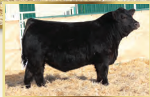
WHEATLAND MICH BULL 8108F