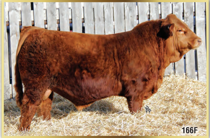
JPCC Ignition 166F