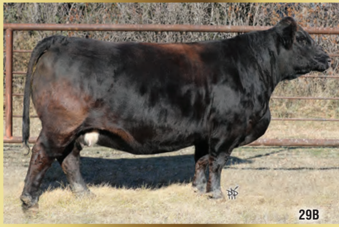
JGCC Foxy Morgan 29B