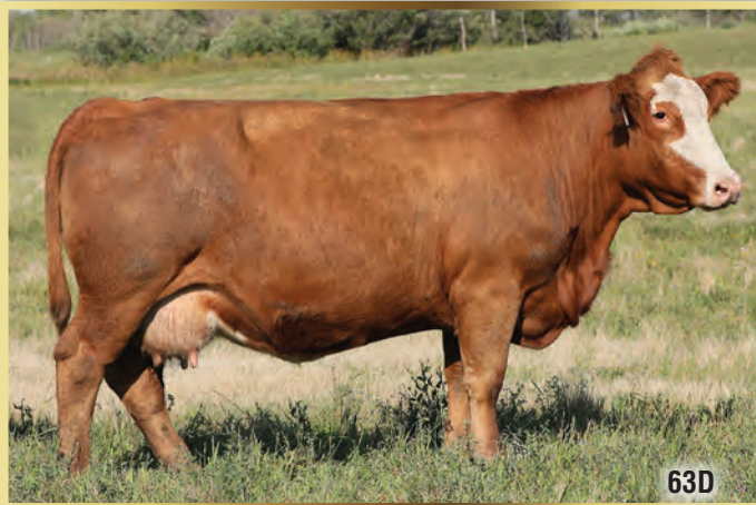
JGCC Miss Northern 63D