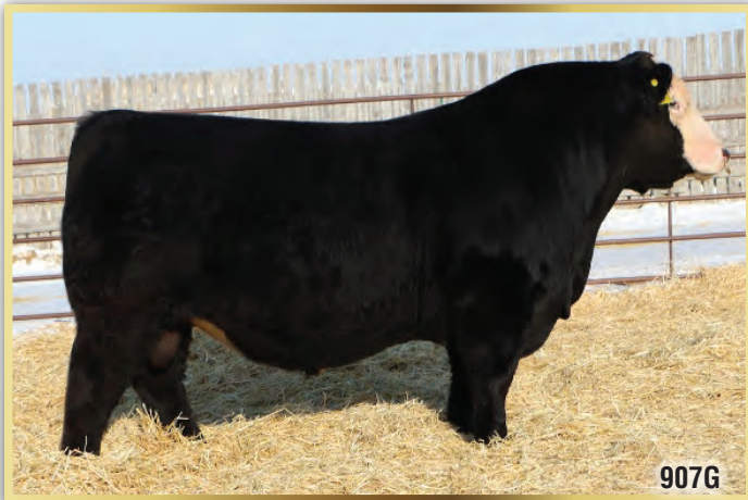
LER Man O' War 907G