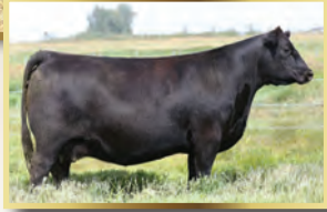
BLAIR'S BARBARA 621E