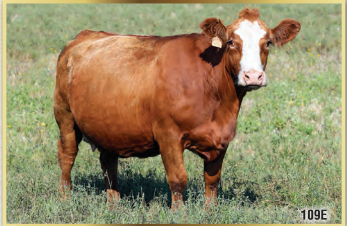
JGCC Miss Northern 109E