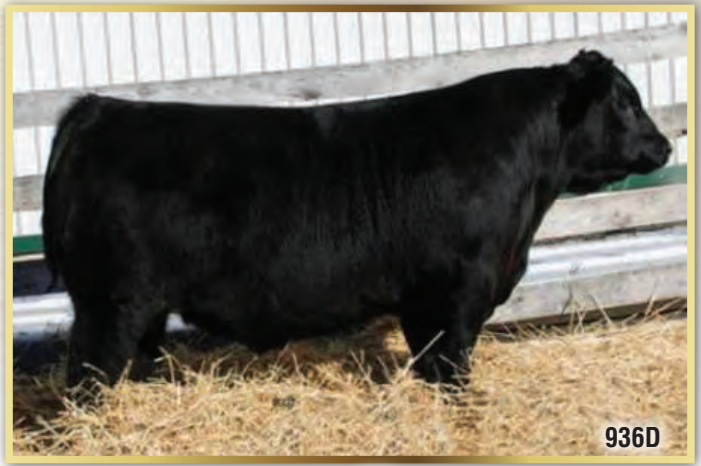
PFLC Brilliance 936D