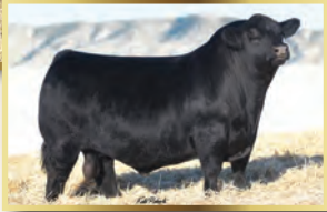
WHEATLAND ROYAL FLUSH 435