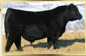
SIX MILE CACHE CREEK 804E