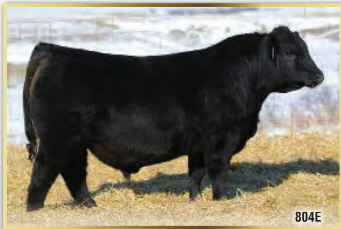
SIX MILE Cache Creek 804E