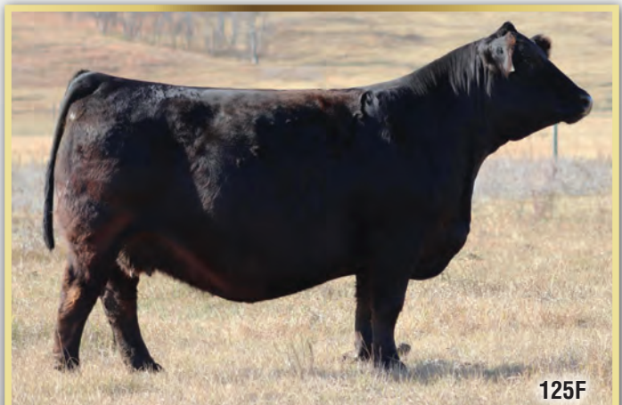
JGCC Linnette 125F