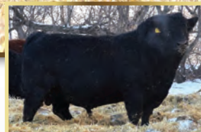
JPCC SUPER SMOOTH 69B