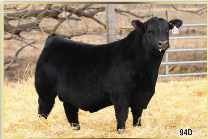
SIX MILE Desert Storm 94D