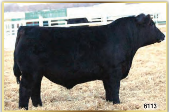
MICH WHEATLAND Cash Flow 6113