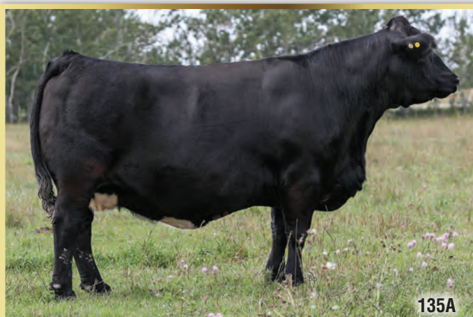
MBJ Springcreek Goldie 135A