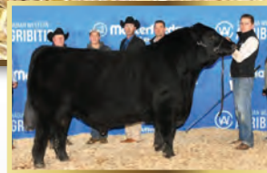
CHESTNUT TURNING HEADS 29