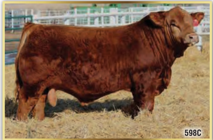
WHEATLAND Kill Switch 598C