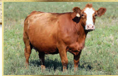
JPCC MISS NORTHERN 109E