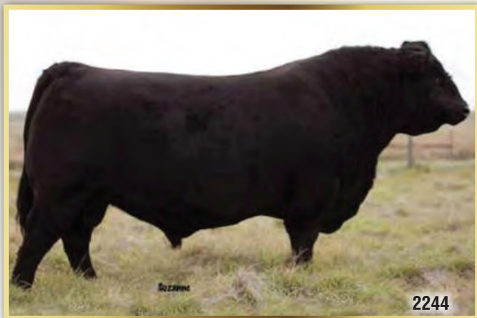
S A V Harvest Moon 2244