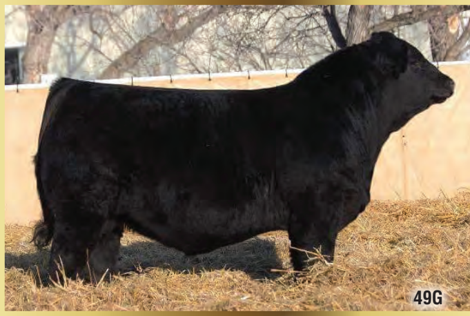
JPCC Confederate 49G