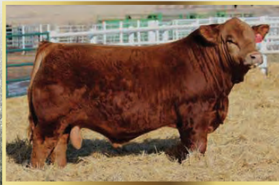
WHEATLAND KILL SWITCH