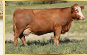
JPCC MISS NORTHERN 63D