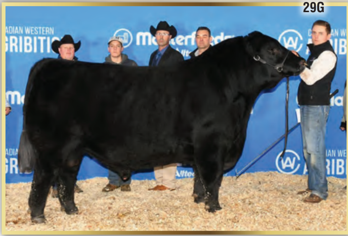
IMP Turning Heads 29G