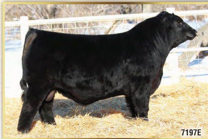
MICH WHEATLAND Hicaliber 7197E