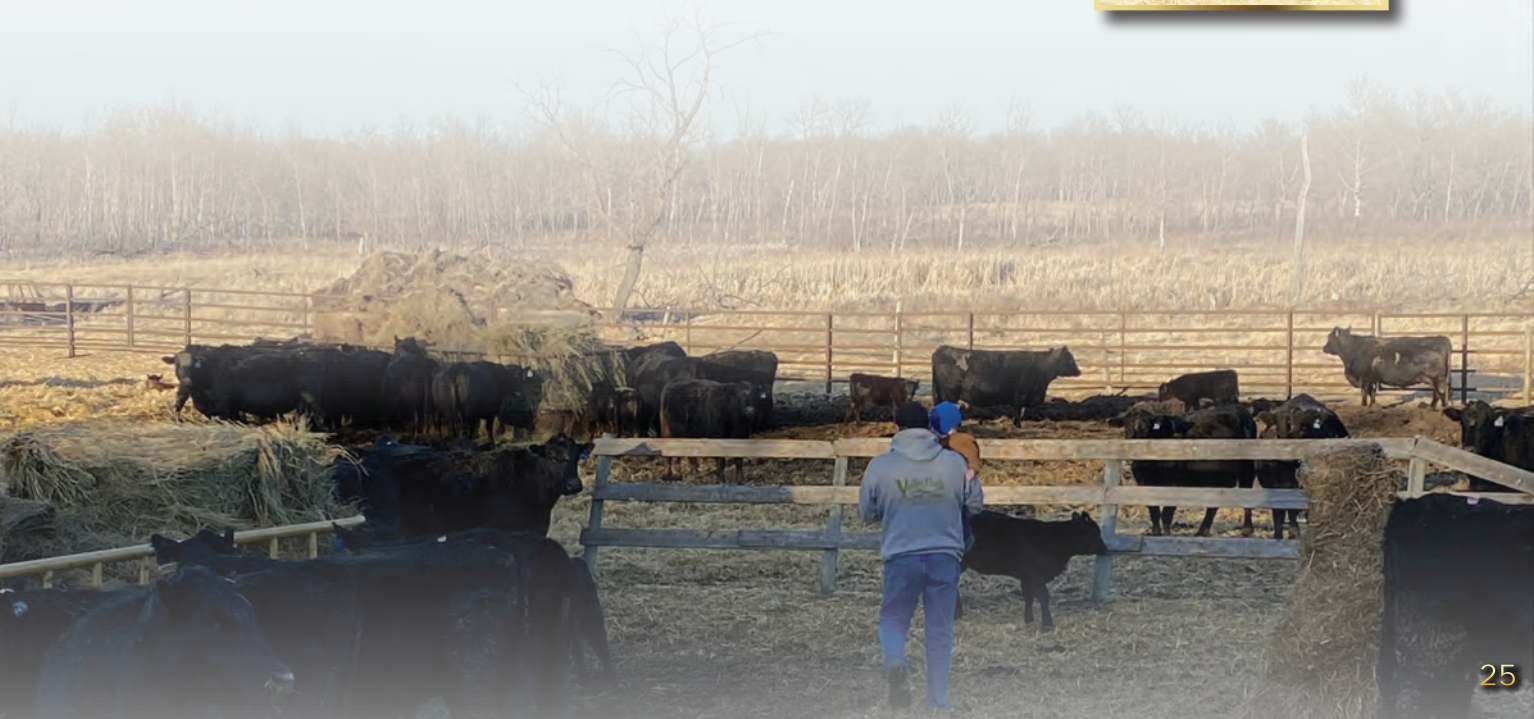
MICH WHEATLAND HICALIBER 7197E