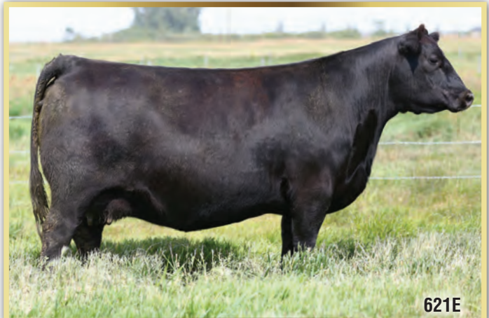
BBC Blair's Barbara 621E