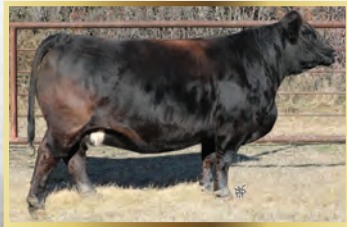
JPCC FOXY MORGAN 29B