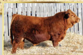
JPCC IGNITION 166F