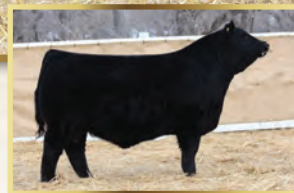
WHEATLAND BULL 8100F