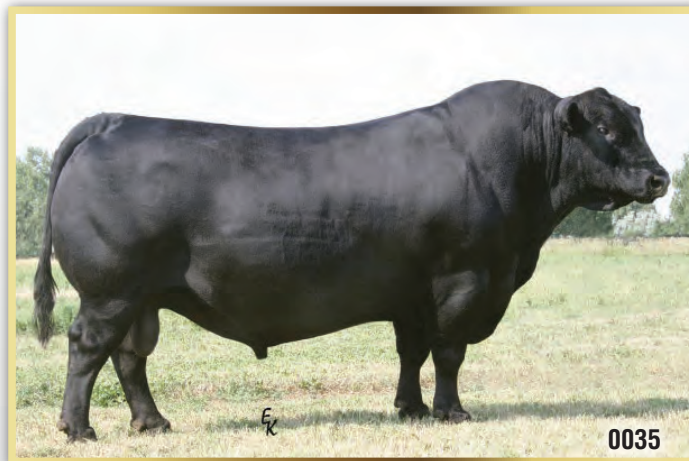
S A V Final Answer 0035